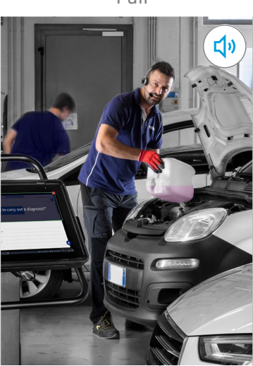
"Hey TEXA, start diagnostic scan"

Allow Activating Functions At A Distance Or If Hands Full