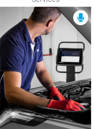
"Hey TEXA, zoom in the parameter"

Voice Activated Command Assistant & Suggested Services